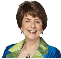
Pam Ayres MBE: English Poet, Comedian and National Treasure.

She hits the nail on the head. She makes us laugh, and if we can see ourselves in her witty words it's all the funnier. A dose of Pam does us good; much like a visit to the WoS panto.