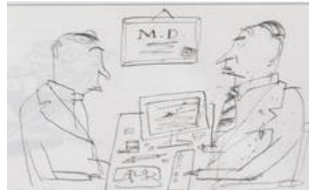
'Nothing serious. Try cutting down on your intake of coronavirus news for a couple of weeks'.