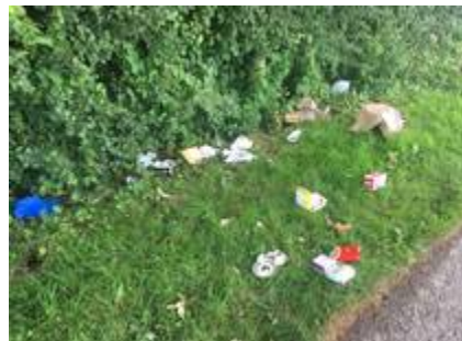
Rodley Road in lockdown.