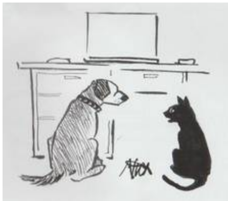
'Oh, come on—you didn't expect "woof to be still available as a password?"'

As the lockdown eases and those who have been shielding can look forward cautiously to more freedom of movement, the helpline is likely to be less necessary. This is just as well as many of our volunteers will be returning to work, if they have not done so already. We will continue to help as much as we can and will keep a close eye on the coronavirus infection rate in case there are signs of a 'second wave'. Di Landon