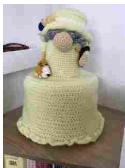
A unique raffle prize, a regal toilet roll cover

The whole weekend was exactly what a community is all about. Lots of people doing their bit, adjusting arrangements in line with the weather, Covid etc and just coming along and enjoying themselves with lots of chatting and laughter. Afterwards we received this thank you note, which was much appreciated.