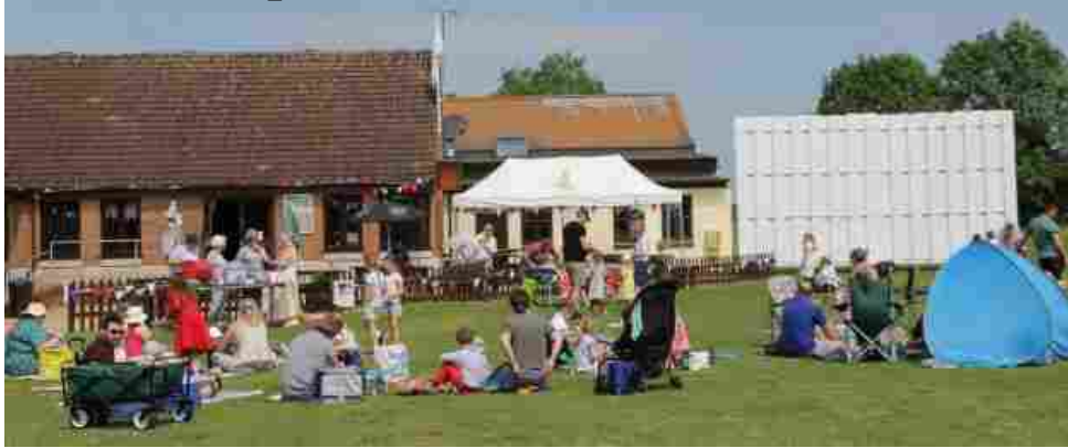
Families enjoying the sunshine at the Teddy Bears Picnic

There was something for everyone at the Parish Hall over the Platinum Jubilee weekend. The celebrations began with the Teddy Bears Picnic, with lots of families spreading their rugs out on the grass in glorious sunshine and enjoying their picnics. With plenty of space to play, a tombola of soft toys, a craft area in the lounge for crown making and cake decorating, a family trail and a raffle, there was lots to do. A wonderful selection of crowns had been entered which made choosing a winner very tricky, but every entrant won a prize.