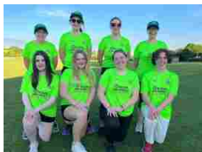
Westbury's team against Huntley

There was a fun evening of cricket at the Parish Hall on 21st June when