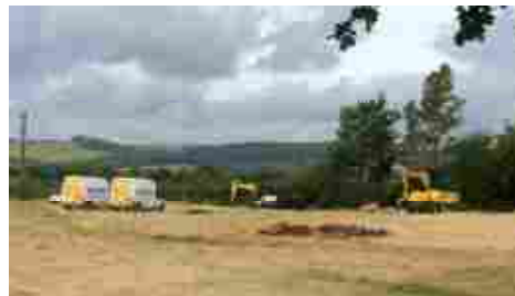
Work has now begun on the new school playing field

Burial Ground Extension At long last all the necessary permissions have now been granted and we have since heard that work on the school playing field can commence on Monday 27 th June. In the meantime the Public Works Loan Board interest rate has increased. However, we have been advised that when the drainage