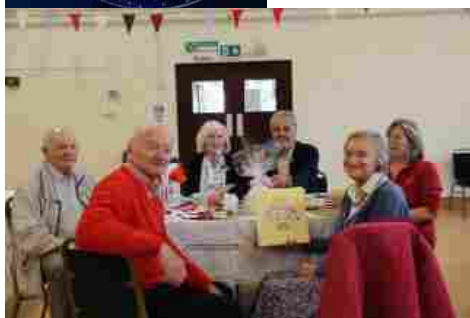
Raffle prize winners at the Saturday afternoon tea

and white televisions. We also had a quiz and I think we all enjoyed an afternoon of good company and a magnificent selection of scones and cakes.