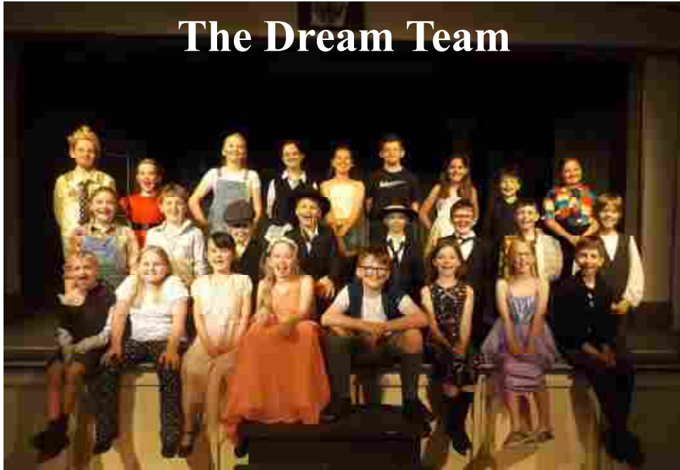
The full cast of Westbury-on-Severn School's 'Dream On'

After two years without a live production by the children of Westbury School due to Covid, it was a real joy to be able to see their performance of Dream On, which was staged at the Parish Hall on 7 th and 8 th July.