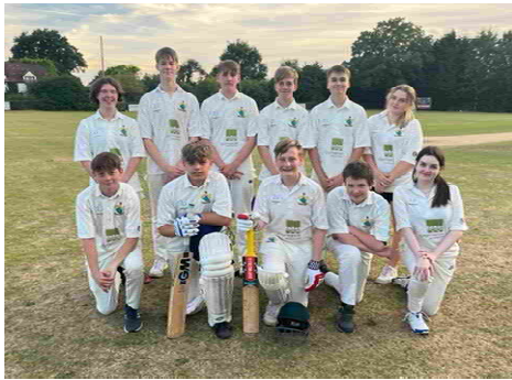
The Under 15s