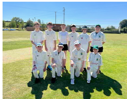
The Under 13s

The U15, U13 and U11's all played in-matches during the early part of July to end their league seasons. The U11's and U13's lost their matches however there were some fantastic fielding and individual batting and bowling performances, highlighting the progression across the teams.