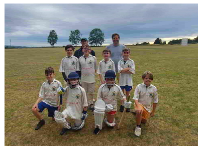
The Under 11s team

for this event. The juniors, parents/carers and coaches all very much enjoyed and appreciated it.