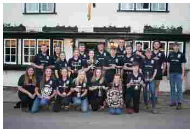
The YFC who meet on Monday evenings, at 7:45pm at Flaxley School Rooms

This achievement has also led to them being named Club of the Month by the National Federation of Young Farmers' Clubs. To donate to the group's cause, go to www.justgiving.com/fundraising/westbury-wheelers .