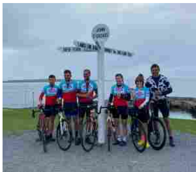
The 'Westbury Wheelers' at their journey's end