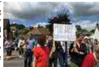
In June 2022 villagers in Aylburton did a mass crossing of the A48 to highlight the need for a pedestrian crossing.

in support of their campaign and have invited us to do likewise. They have suggested that we time ours for 2pm —