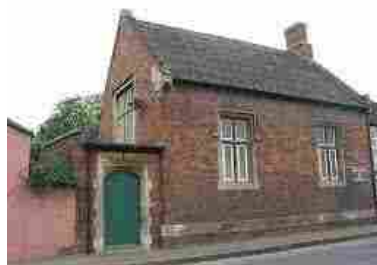
Westbury School — soon to be 175 years old