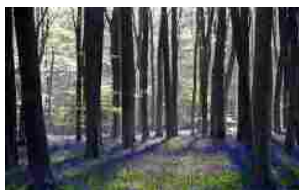
Something to look forward to in April

So, what about April? There's a saying that if it thunders on All Fools Day (1st April) it brings good crops of corn and hay but although that seems a doubtful way of predicting the weather, the Met Office believes that there is some truth in the saying that 'March winds and April showers bring forth May flowers' as 'April does tend to be a showery month,