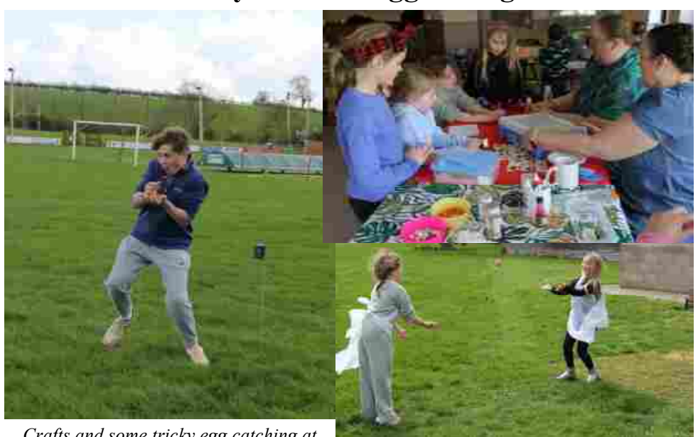
Crafts and some tricky egg catching at the Easter Monday Funday