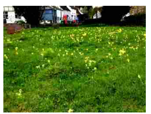
The carpet of cowslips in the churchyard

As we had hoped, the sun shone for our April working party in the churchyard, and all our past efforts paid off as we spent the morning in the sunshine surrounded by masses of wildflowers.