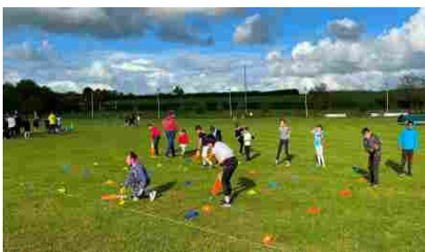
The Juniors enjoying themselves earlier in the season

As another junior season draws to a close, we reflect over our time together and wistfully reminisce about the sounds of laughter and fun that drift across the field on a Friday evening. As a junior committee we are so proud of our junior members and grateful to their parents and carers for bringing the juniors to practice sessions and games. It isn't easy juggling family life so we value all the time given to help make our junior side such a success.