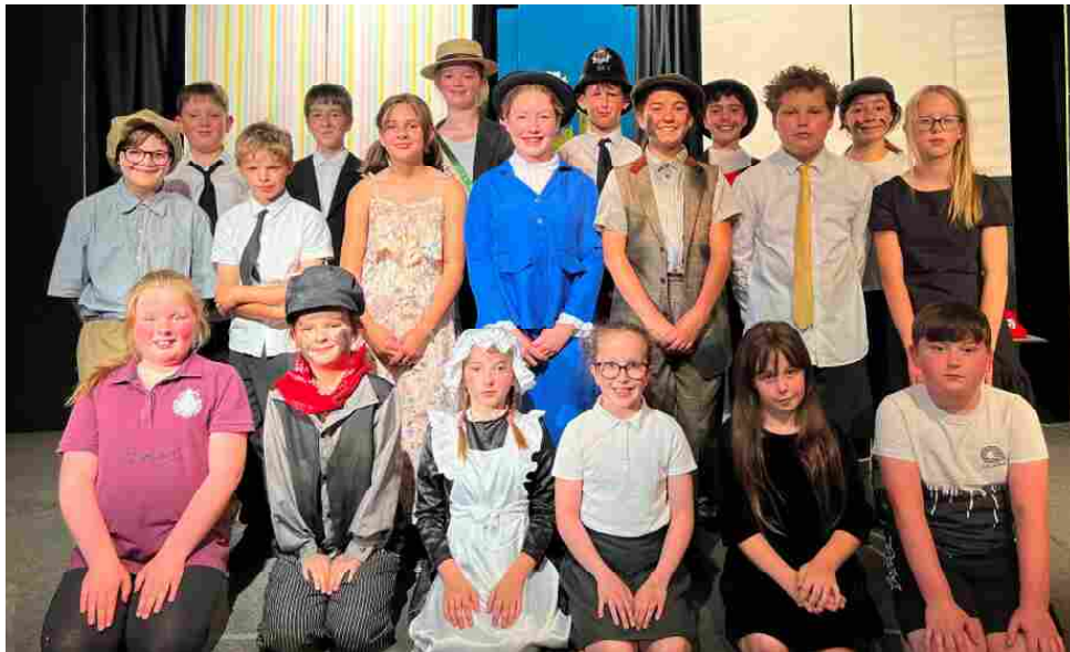
The cast of Westbury School Drama Club's production of Mary Poppins

The Parish Hall was filled to the brim the first weekend in July, as the children of Westbury-on-Severn Primary School's drama club performed in Mary Poppins. The production was, like Mary Poppins herself, 'practically perfect in every way' as children from Year 3 to Year 6 sang, danced and acted their socks off. Thanks to all who came to clap and cheer the children in their two sell-out performances, which have raised vital funds for the school.