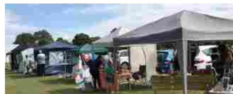
Stalls set up for the Craft Fair