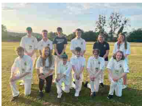
The Under 15s team