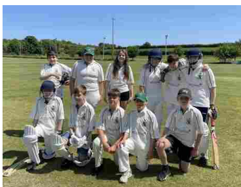
The Under 13s team

We have some exciting events coming up in August to celebrate the club's 70 th Anniversary. More about this next time but a date for your diary is Sunday 27 th August when the club will be holding a 70 th Anniversary celebration with cricket and BBQ fun so please do try to come along and support us.