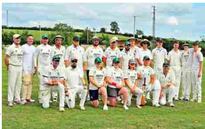
The teams assembled for the Ben Nice Memorial match

The All Stars are also making great progress and are having huge amounts of fun playing the different games that are provided each week. The All Stars focus on cricketing basics and the cry of "show me your All Stars Position" can be heard across the field every week.