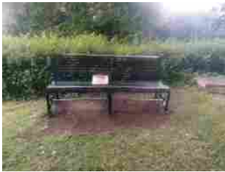
The freshly painted seat

village. Only one planning application had been received, which was for the erection of a two storey rear extension and single storey front extension at Chapel House in Broadoak, to which there were no objections.