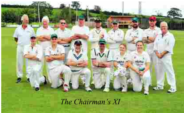
The Chairman's XI

The match was very well fought out with the Players narrowly taking the win. Players and spectators old and new came together to enjoy a game of cricket, look through some