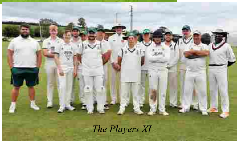
The Players XI

a huge thank you to every single person who contributed to the 70 th Celebrations this weekend. The club spirit was shining strongly and the successes celebrated this weekend will continue long into the future.