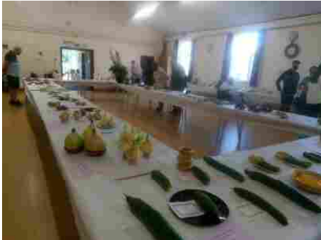
Exhibits on show in 2021

Get your entries in now for the Flower and Produce Show!