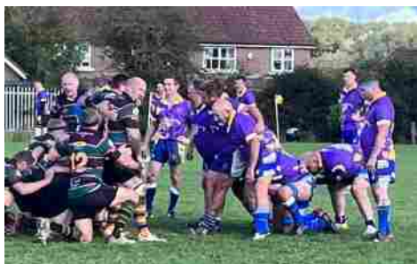
Westbury Veterans v Frampton Cotterell