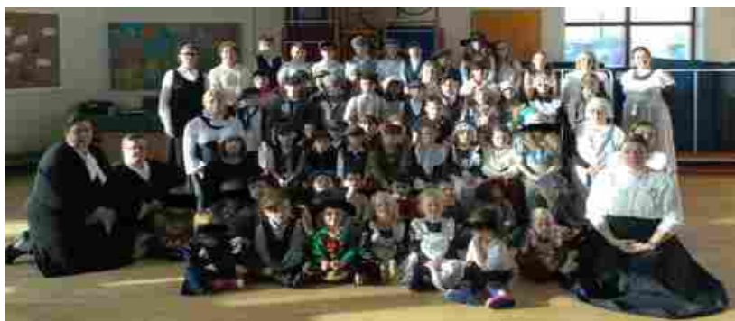
Westbury School staff and pupils on Victorian Theme Day

plans of the school through history. Chestnuts (pre-school) created flap-jacks using the recipe book made by the PTA in 1981.