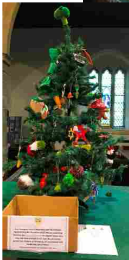
and Westbury School.