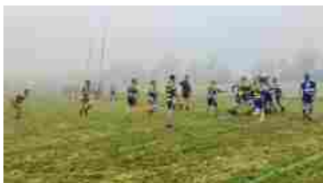
Westbury RFC v Cainscross on 2nd Dec

started the match at a blistering pace. Cainscross, blessed with some heavy artillery up front and a skilful back line, were always going to be a handful for the men in blue and white. After some great play by the visitors, Westbury forced a turnover and stitched together a number of phases to put Paul Reddan into space (with plenty of work to do), he opened Westbury's account with a well taken try. Cainscross immediately rallied to even the scores 5 - 5. Following the initial tit for tat, an arm wrestle of biblical proportions ensued. Both teams sought to play an expansive game and showed great endeavour but often came unstuck by a ball like a bar of soap and ferocious defence by both teams. The half time whistle sounded and Westbury were trailing 10-12.