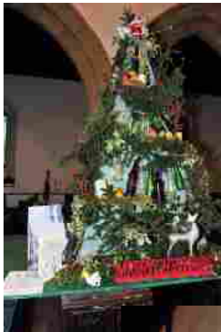
The Red Hart, Blaisdon