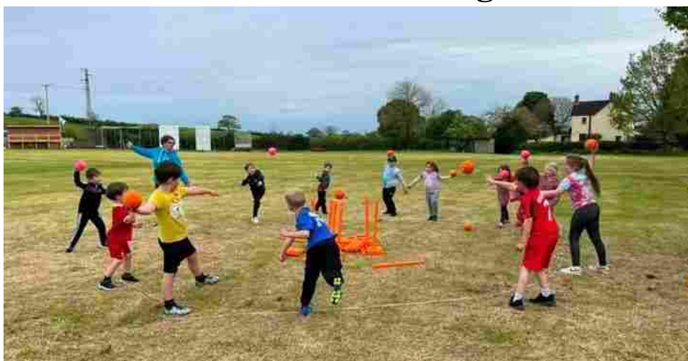
Westbury's All Stars enjoying their first outdoor training of the season

After the wettest winter that most of us can remember, any sign that summer is not far away is very, very welcome and preparations for the coming cricket season make us think of sunnier days ahead. On Friday 26 th April, Westbury Junior Cricket Club began their outdoor training. It was brilliant to see all the juniors back on the cricket pitch and lovely to welcome back old members and start getting to know new ones.